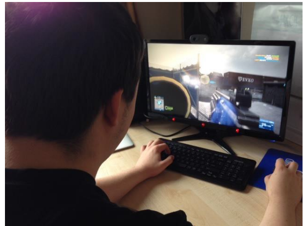
Figure 1 - Experimental setup. Participants played Battlefield 3 with the mouse and keyboard while their gaze was tracked by a Tobii EyeX tracker mounted below the screen.

Permission to make digital or hard copies of all or part of this work for personal or classroom use is granted without fee provided that copies are not made or distributed for profit or commercial advantage and that copies bear this notice and the full citation on the first page. Copyrights for components of this work owned by others than ACM must be honored. Abstracting with credit is permitted. To copy otherwise, or republish, to post on servers or to redistribute to lists, requires prior specific permission and/or a fee. Request permissions from Permissions@acm.org . CHI PLAY 2015 , October 03 - 07, 2015, London, United Kingdom © 2015 ACM. ISBN 978-1-4503-3466-2/15/10...$15.00 DOI: http://dx.doi.org/10.1145/2793107.2793137